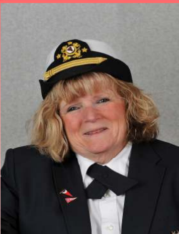
Commodore Colleen Cashman