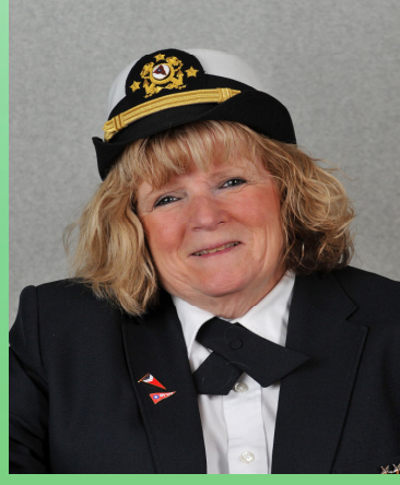
Commodore Colleen Cashman